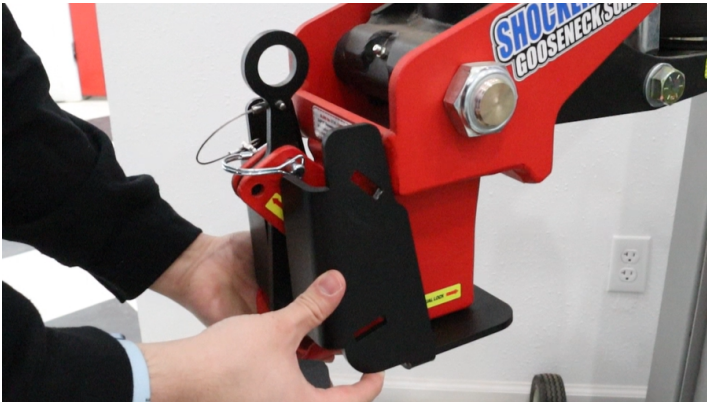
Figure 1: Slide coupler lock frame over Shift Lock®