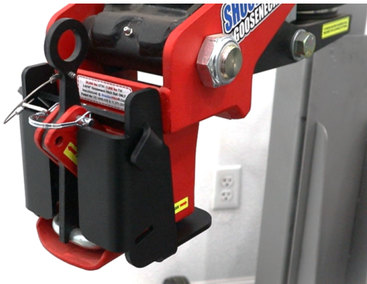
Figure 3: Top insert for 2-5/16" couplers, bottom insert for 3" couplers