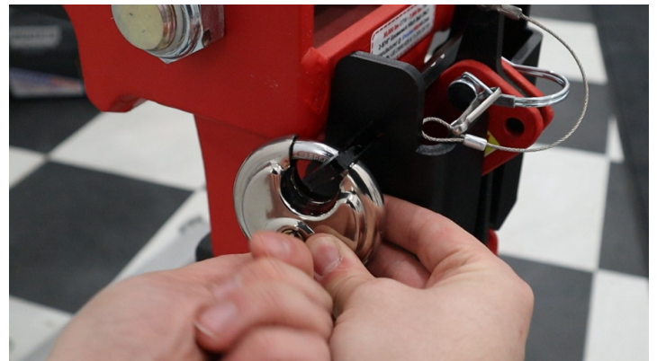
Figure 4: Attach padlock of choice to lock handle (not included)