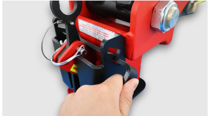
Figure 2: Insert lock handle through inserts