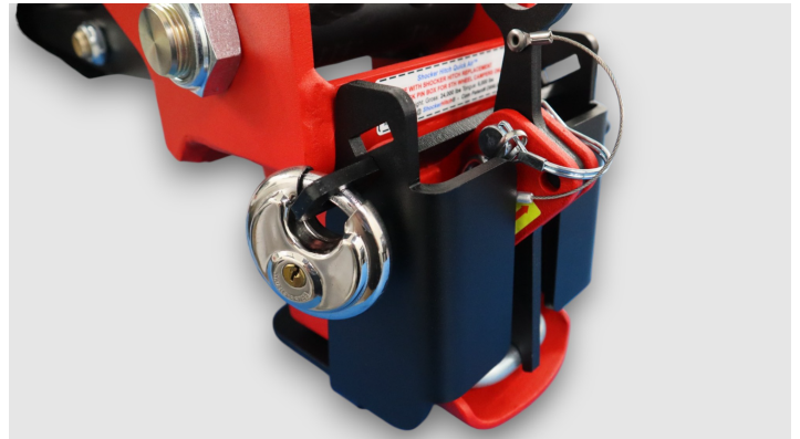
Figure 4: Attach padlock of choice to lock handle (sold separately)