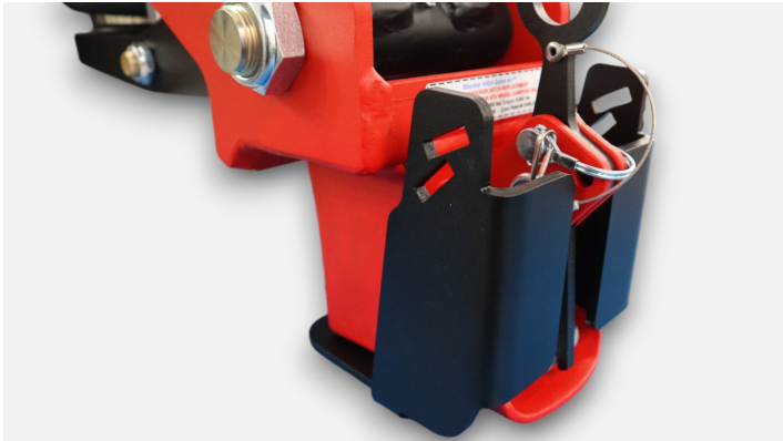
Figure 1: Slide coupler lock frame over Shift Lock®