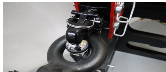
Figure 4: Lower lunette ring into frame, latch handle, re-install pin.