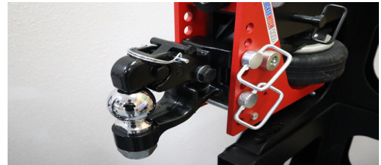
Figure 1: Install pintle hook with the lever & ball facing upward.

-Towing capacity is limited by the lowest rated component. It is imperative that you always read and follow the tongue and towing weight recommendations of the truck, receiver, hitch, ball, coupler and trailer you are towing. Any modification to the Shocker Hitch or it's components will void warranty and is done at your own risk. Manufactured at Shocker Hitch, LLC. USA.