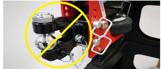
Figure 2: DO NOT install pintle hook upside down.