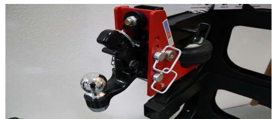
Figure 5: Open latch and re-install pin keep pintle in the open position.