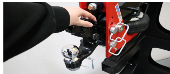
Figure 3: Open by removing pin and lifting latch handle.