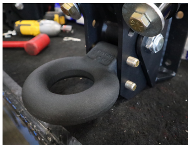
Figure 2: Insert Two Bolts Through Shocker Hitch & Pintle Ring