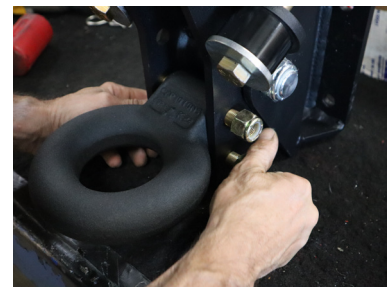
Figure 3: Tighten Bolts & Torque to 100 Ft. Lbs.