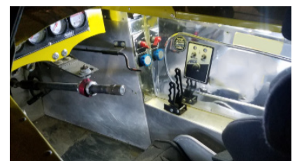
Figure 5: Light up desired area.