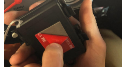
Figure 1: Peel the protective layer from the 3M adhesive & attach to desired surface.