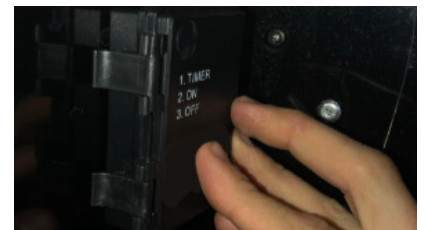
Figure 3: Firmly press the power box to secure it in desired area.