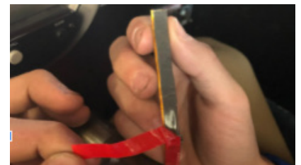
Figure 2: Peel the protective layer from the 3M adhesive from the end of the light strip.