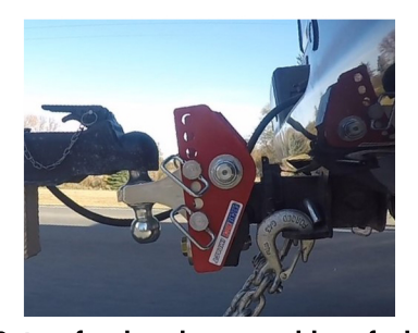
Figure 2: Set up for rise - bump cushions facing ground