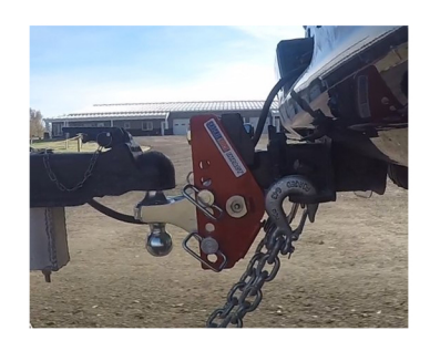
Figure 1: Set up for drop - bump cushions facing sky